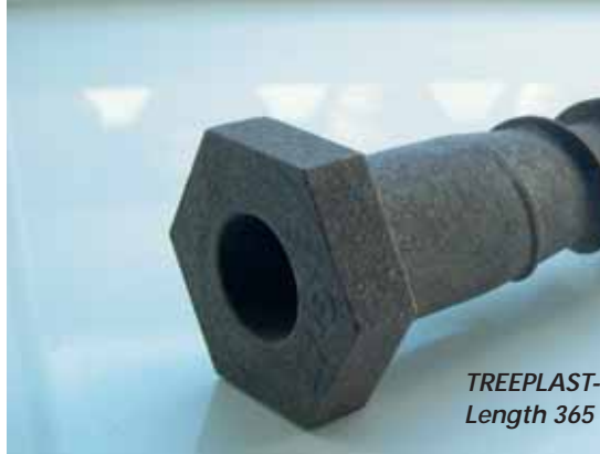
TREEPLAST- Length 365

As a bio-synthetic material, TREEPLAST combines the advantages of renewable raw materials with those of the modern synthetic material processing such as the injection mould. Different biogenic materials can be processed by this method into series products and, they are machinable like wood. Using this bio-synthetic material, dismantling and reduction into the biological circulation do not pose any problems.