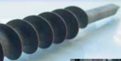
Straw screw mm, ø 37 mm

After the bionic optimisation, the red areas have disappeared, although the thread base is deformed only negligibly.