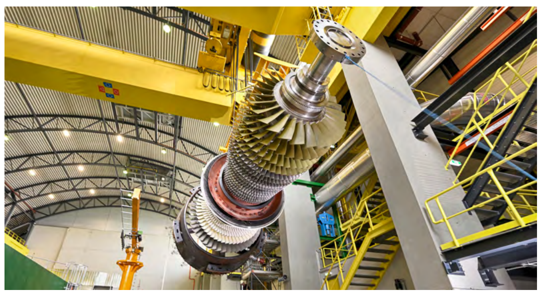
Gas turbine at the Donaustadt power plant site, home to the first-ever trial of cofiring hydrogen for energy generation

The trial run involved cofiring different quantities of green hydrogen with the natural gas currently used on around ten test days (between mid-July and mid-September). Having started with 5 per cent hydrogen by volume, the project partners gradually increased this to as much as 15 per cent. They will analyse the data that they have collected on the plant's operational behaviour in detail between now and spring 2024. The aim is to get these gas turbines certified to have up to 15 per cent hydrogen by volume added into them in day-to-day operations. There are plans for a follow-up project to increase this figure to around 30 per cent. Even just co-firing 15 per cent green hydrogen would save some 33,000 tonnes of CO<sub>2</sub> a year at the Donaustadt power plant.