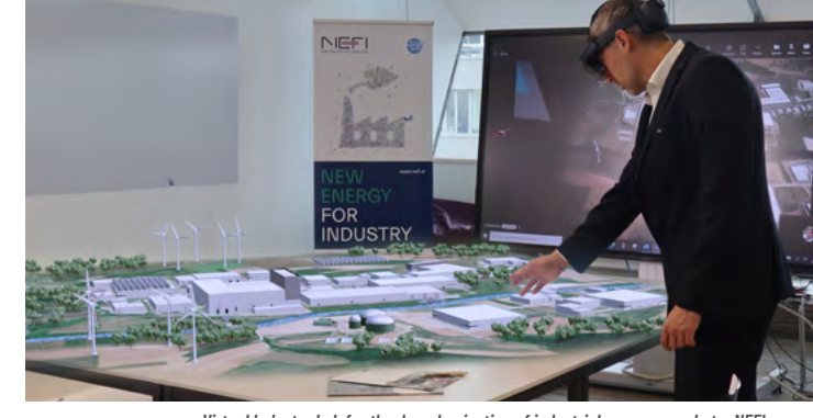
Virtual Industry Lab for the decarbonisation of industrial processes