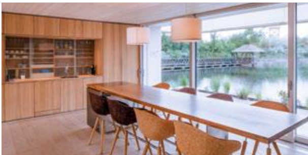
LISI House, Interior, Blaue Lagune Vienna