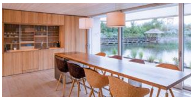
LISI House, Interior, Blaue Lagune Vienna