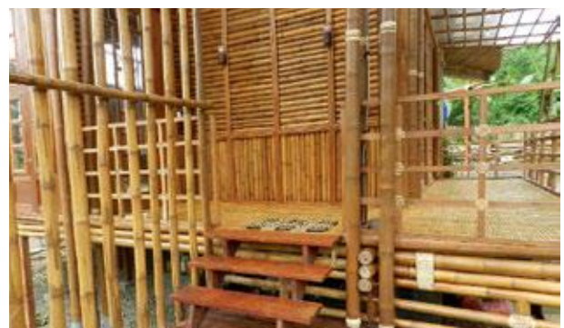
Zero Carbon Resorts, Demonstration building, Photo: GrAT

The building is self-sufficient in terms of energy, operating exclusively with renewables. The electricity for the entire cottage is generated with photovoltaics. A solar system supplies hot water for heating and cooking. Sunlight is used for lighting, too; a daylight lighting system directs light from outdoors through ducts to the rooms inside. Roof design is such that rainwater can be collected centrally. Only about 10 % of annual precipitation on the roof is enough to cover the entire water consumption in the building. As water-saving toilets, shower fittings and taps have been installed, process water consumption and the volume of sewage have been limited. Sewage is purified by means of a biological treatment facility. Drinking water can be obtained from rainwater via a straightforward do-it-yourself filter.