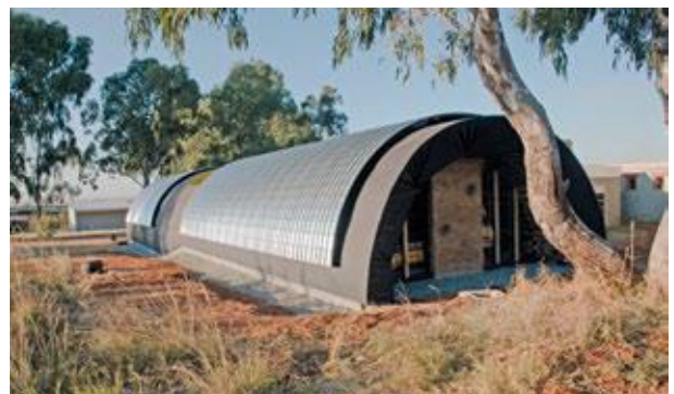
Ithuba Skills College, Johannesburg, Photo: palettenhaus.com

In 2008 the pallet house was awarded the French architecture prize Gaudi, and was then presented at the Biennale di Architettura in Venice. Exhibitions followed in Vienna, Linz (European Cultural Capital in 2009) and Brussels (European Economic and Social Committee/Overshoot Day in 2009). In 2016, coinciding with the 15 th Biennale di Architettura in Venice, a permanent exhibition of the house started in the Architecture and Innovation Zone in the Blaue Lagune in Wiener Neudorf. ■