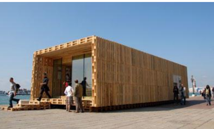
Pallet House, Biennale di Architettura, Venice 2008, Photo: palettenhaus.com

In 2009 the pallet house was developed further in bmvt's programme "Building of Tomorrow" as a passive house and to the production stage. This included establishing structural and physical conformity, simulating thermal bridges in three dimensions and calculating the energy consumption to be expected long-term. As examples two scenarios were investigated: temporary interim use of pallet houses in aspern Vienna's Urban Lakeside, and erecting a low-cost building in South Africa.