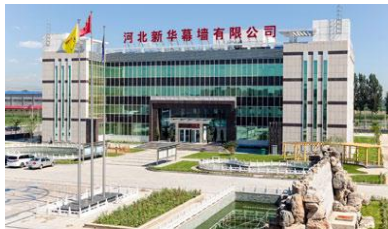
Passive House office building, Zhuozhou/China

The office building (floor area 3,000 m 2 ) and the hostel (2,300 m 2 ) were erected on a precast concrete skeleton and equipped with a composite thermal insulation system made of expanded polystyrene (EPS). In the central ventilation unit two thermal wheels are arranged in tandem, one adapted to recover heat, the other to recover moisture. The heat exchanger is a condensation thermal wheel with ultra-efficient heat recovery; the moisture exchanger is a hygroscopic thermal wheel. The climate of this location makes desiccating air from outdoors a real challenge. In this particular case more than one stage is involved – both passively in the moisture exchanger and also in an active desiccation process. A chiller driven by a heat pump cools air down till it reaches the dewpoint, when the moisture in the air condenses. Humidity is controlled room by room by means of metal heating/cooling ceilings connected to heat pumps via a separate heating/cooling water circulation system. All these heat pumps are connected to a geothermal grid with 30 downhole heat exchangers.