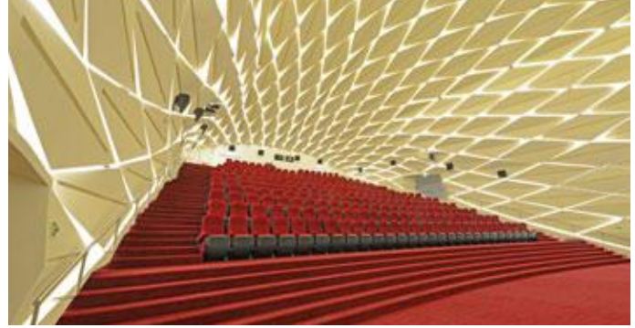
Sheikh Zayed Desert Learning Center

One aim of bmvit's technology programmes "Building of Tomorrow" and "City of Tomorrow" is to spread the results gained from research activities widely. Among other things, beacons of innovation are realized in other countries, so as to help improve energy efficiency around the world with the aid of Austrian know-how.