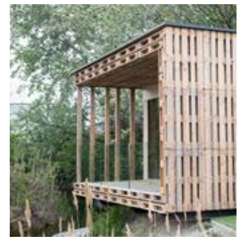
Pallet House, Blaue Lagune Vienna, Photo: palettenhaus.com

„In future construction must take not only energy efficiency but also resource conservation seriously. The Pallet House is meant to help us give more thought to using and reusing materials sustainably.“