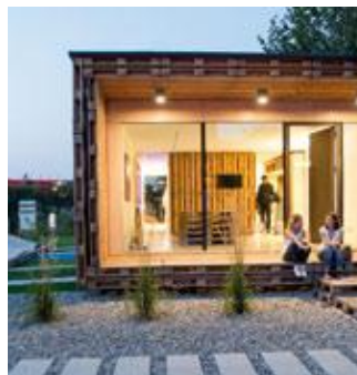
Pallet House, Blaue Lagune Vienna, Photo: palettenhaus.com

For a South African school, the Ithuba Skills College, a simplified design was worked out and implemented in a township south of Johannesburg. The Slumtube, a barrel-shaped longhouse that saves on wood, is insulated with straw, the framing filled in with clay and covered over with sheet metal. One key aim was to keep