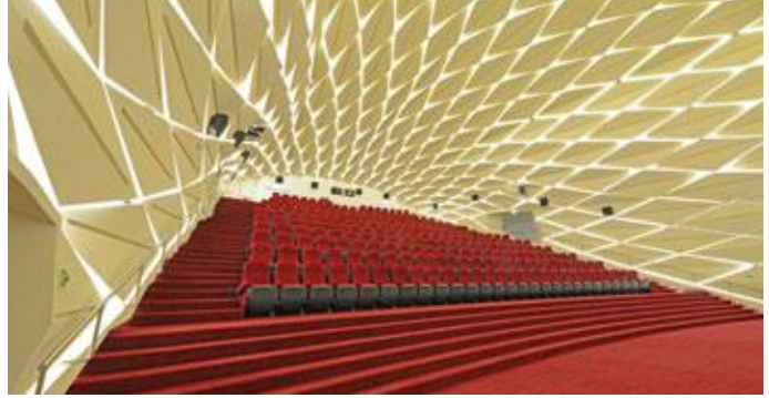
Sheikh Zayed Desert Learning Center

One aim of bmvit's technology programmes "Building of Tomorrow" and "City of Tomorrow" is to spread the results gained from research activities widely. Among other things, beacons of innovation are realized in other countries, so as to help improve energy efficiency around the world with the aid of Austrian know-how.