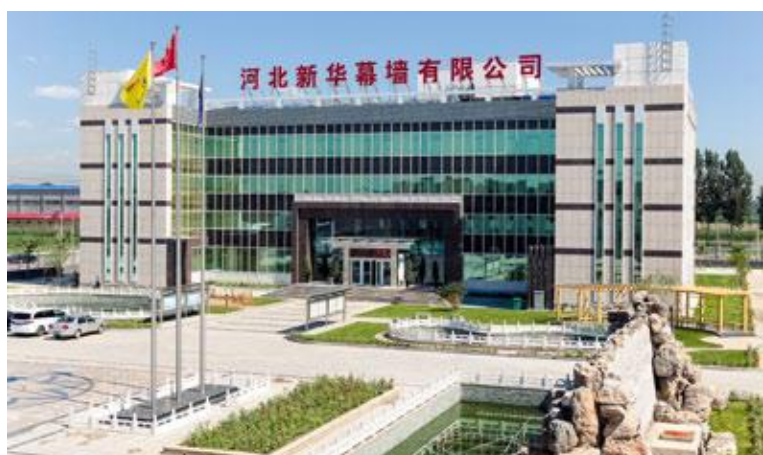
Passive House office building, Zhuozhou/China, Photo: Schöberl & Pöll GmbH

The office building (floor area 3,000 m 2 ) and the hostel (2,300 m 2 ) were erected on a precast concrete skeleton and equipped with a composite thermal insulation system made of expanded polystyrene (EPS). In the central ventilation unit two thermal wheels are arranged in tandem, one adapted to recover heat, the other to recover moisture. The heat exchanger is a condensation thermal wheel with ultra-efficient heat recovery; the moisture exchanger is a hygroscopic thermal wheel. The climate of this location makes desiccating air from outdoors a real challenge. In this particular case more than one stage is involved – both passively in the moisture exchanger and also in an active desiccation process. A chiller driven by a heat pump cools air down till it reaches the dewpoint, when the moisture in the air condenses. Humidity is controlled room by room by means of metal heating/cooling ceilings connected to heat pumps via a separate heating/cooling water circulation system. All these heat pumps are connected to a geothermal grid with 30 downhole heat exchangers.