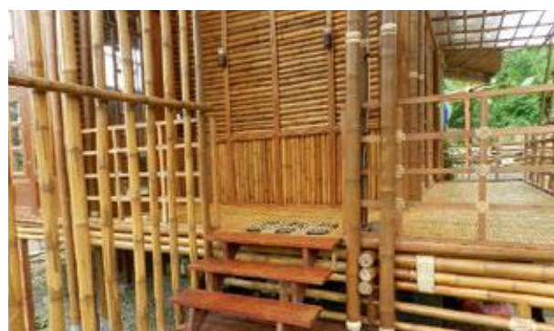
Zero Carbon Resorts, Demonstration building, Photo: GrAT

The building is self-sufficient in terms of energy, operating exclusively with renewables. The electricity for the entire cottage is generated with photovoltaics. A solar system supplies hot water for heating and cooking. Sunlight is used for lighting, too; a daylight lighting system directs light from outdoors through ducts to the rooms inside. Roof design is such that rainwater can be collected centrally. Only about 10 % of annual precipitation on the roof is enough to cover the entire water consumption in the building. As water-saving toilets, shower fittings and taps have been installed, process water consumption and the volume of sewage have been limited. Sewage is purified by means of a biological treatment facility. Drinking water can be obtained from rainwater via a straightforward do-it-yourself filter.