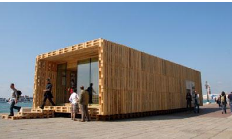
Pallet House, Biennale di Architettura, Venice 2008