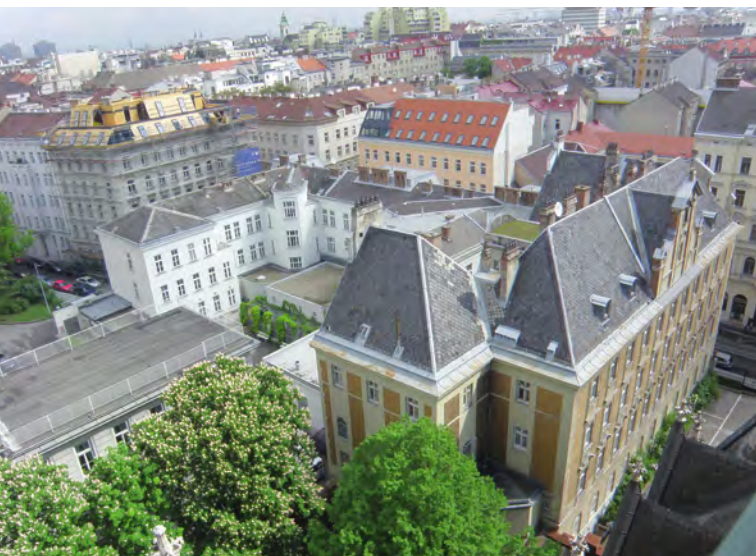
Kaiserstraße Vienna