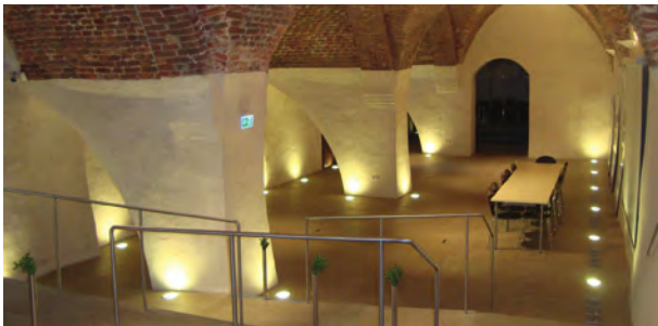
Renovated function room, Source: AEE INTEC

The starting-point for renovation was a master plan (Arch. DI Michael Lingenhöle) with a comprehensive strategy for modernizing the entire monastery premises. Together with experts from AEE INTEC, the (utterly committed) monks succeeded in developing a four-stage “energy vision” for the monastery and implementing it, starting in 2010 (Architecture HoG Architekten).