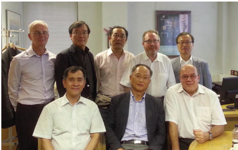
The Korean delegation to IEA CCC