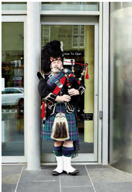
A piper greets delegates at ICMGP