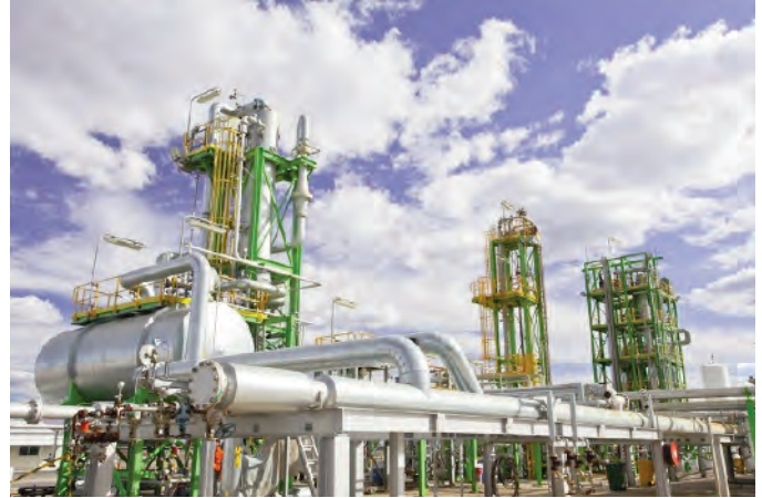
Chinchilla UCG plant, focus of site visit (Linc Energy)

http://ucg3.coalconferences.org . To see the programme, click on 'Enter conference system', then 'Conference Programme'. To view the session contents, click on the small arrows to