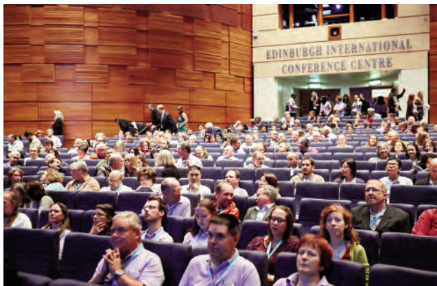
Delegates at ICMGP