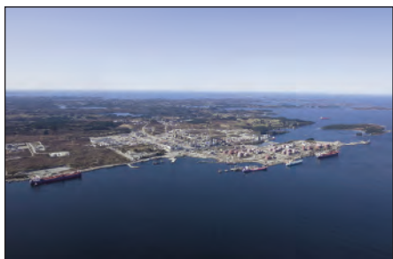
Test plant at Mongstad

Following the success of the 1st Post Combustion Capture Conference in Abu Dhabi, 2011 and the 12th International Post Combustion Capture Network workshops held from 2000 to 2009, IEAGHG is proud to announce the PCCC2 Conference to be held on 17-19 September 2013 at Hotel Grand Terminus, Bergen, Norway. The PCCC conference series is an important gathering for post-combustion capture experts to share their knowledge, findings and expertise. PCCC2 aims to continue the forum to discuss the various issues related to post-combustion capture technologies status and development.