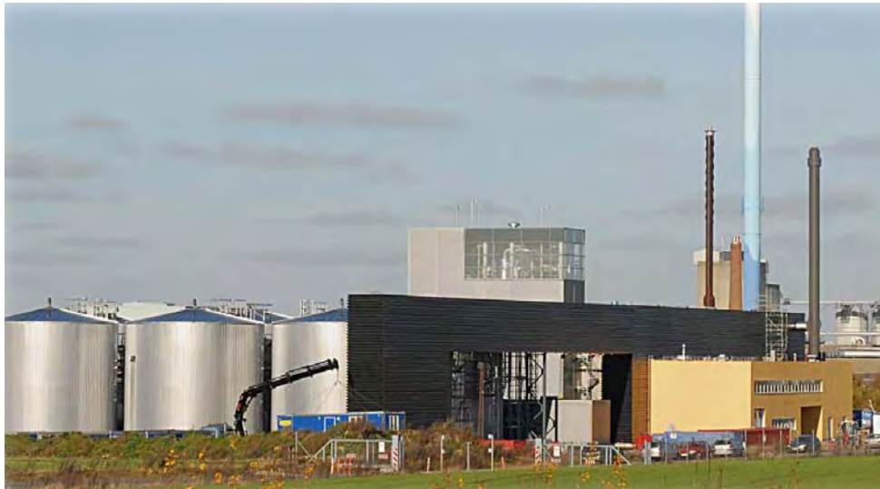
Daka Ecomotion biodiesel plant.

Emmelev A/S - Emmelev Mølle is the only Danish producer of 1st generation biodiesel based on rape seed oil. The annual production is around 100,000 tons of biodiesel, but there are plans for expanding the capacity. The major part of the production is shipped to Germany. Besides biodiesel, glycerine and feed cake are also produced at this plant.