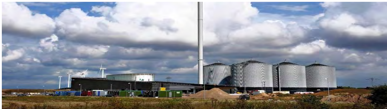
Figure 1. The Maabjerg biogas plant already in operation

stations are currently available. There is some discussion on projects to convert buses to using biogas, but in the short to medium term biogas is only expected to have limited use as a transport fuel.