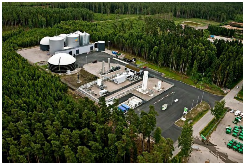
Lidköping Biogas: one of the world's first plants for liquefied biogas, as to fuel cars and trucks more

The AMFI Newsletter is prepared for the members of the Implementing Agreement for Advanced Motor Fuels of the International Energy Agency (IEA/AMF). The AMFI releases four electronic newsletters each year.