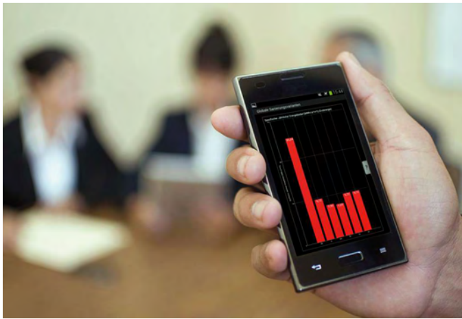
Example of a simple tool easy and quick to use