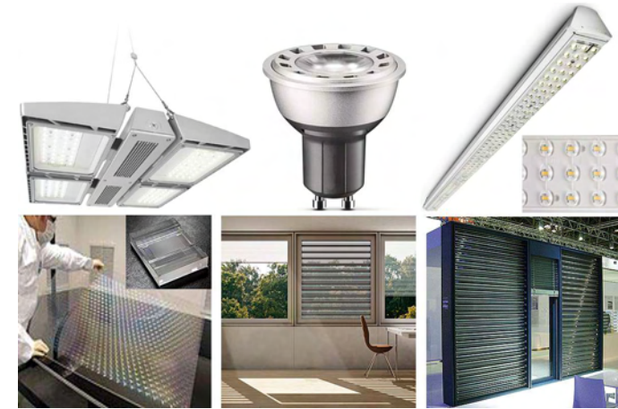
New systems of lamps/luminaires and façades for retrofitting