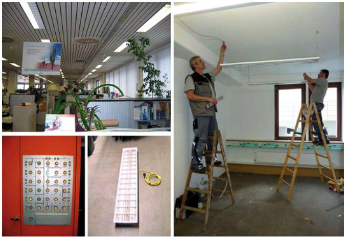
Outdated lighting solutions and retrofit in action