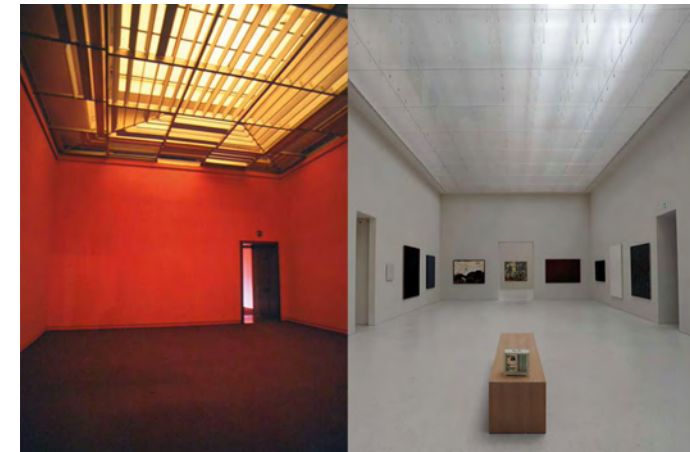
The "New Gallery" (Kassel, Germany) before and after refurbishment

Daylighting Electric Lighting Lighting Controls