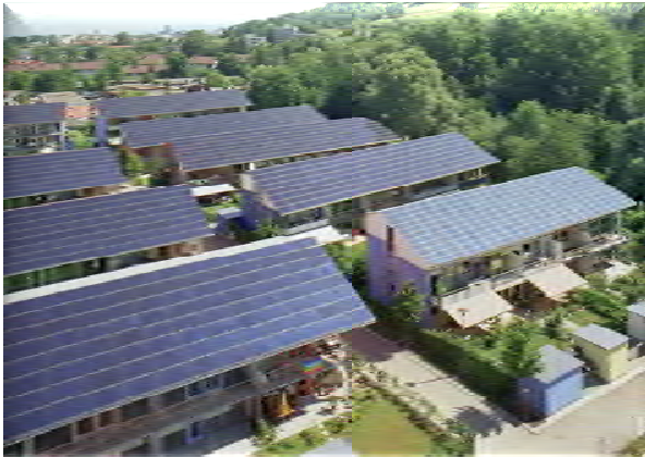
The EnerPos Building, Université de la Réunion, île de la Réunion, France.