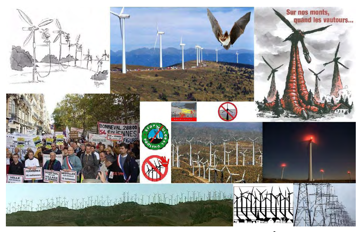
Figure 1-2: Negative images of wind energy<sup>5</sup>