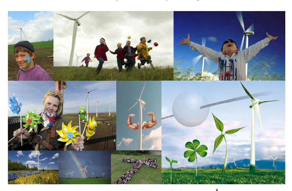
Figure 1-1: Positive images of wind energy<sup>3</sup>

Reports on heated debates and strong opposition to wind energy projects have drawn attention to social barriers to renewable energy production (Der Spiegel 2004; The Economist 2010). While public opinion polls usually show that large majorities support renewable energies – including wind energy – and environmental organizations frequently support them as well, many projects meet with resistance from local communities or from environmental organizations. The importance of the issue has also been recognized by the wind industry (EWEA 2009), and topics such as consultation have found their way into industry's best practices<sup>2</sup>.