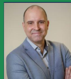
CARSTEN GACHOT (TU VIENNA) Tribology in a nutshell - From Helicopters to human implants and beyond