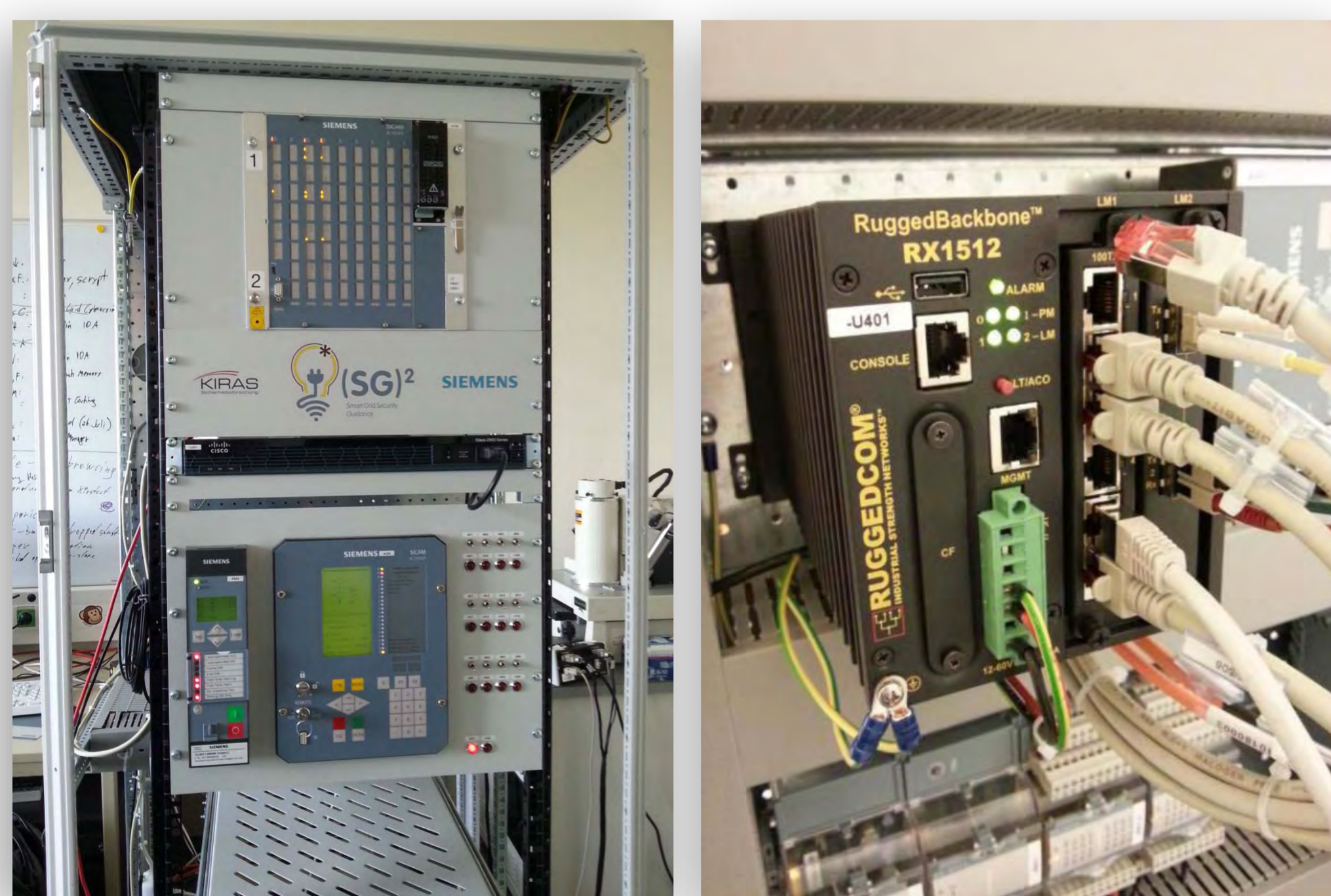
Fig. 3: Substation test system

Next, the risk was assessed for each element of the threat matrix by estimating probability and impact following a semi-quantitative approach. The probability was expressed by the number of cybersecurity incidents p.a., while the impact of a successful attack was determined by monetary loss, customer impact, and geographic range of effects. In several workshops, the consortium members' ratings were discussed and consolidated to ensure the validity of the resulting risk matrix . Currently, mitigation strategies addressing the identified risks are being developed.