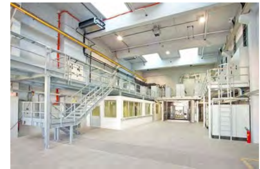
AIT SmartEST laboratory