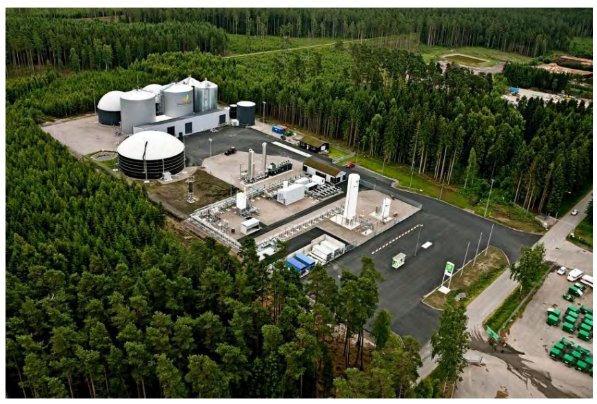
Lidköping Biogas: one of the world's first plants for liquefied biogas, as to fuel cars and trucks more

The AMFI Newsletter is prepared for the members of the Implementing Agreement for Advanced Motor Fuels of the International Energy Agency (IEA/AMF). The AMFI releases four electronic newsletters each year.